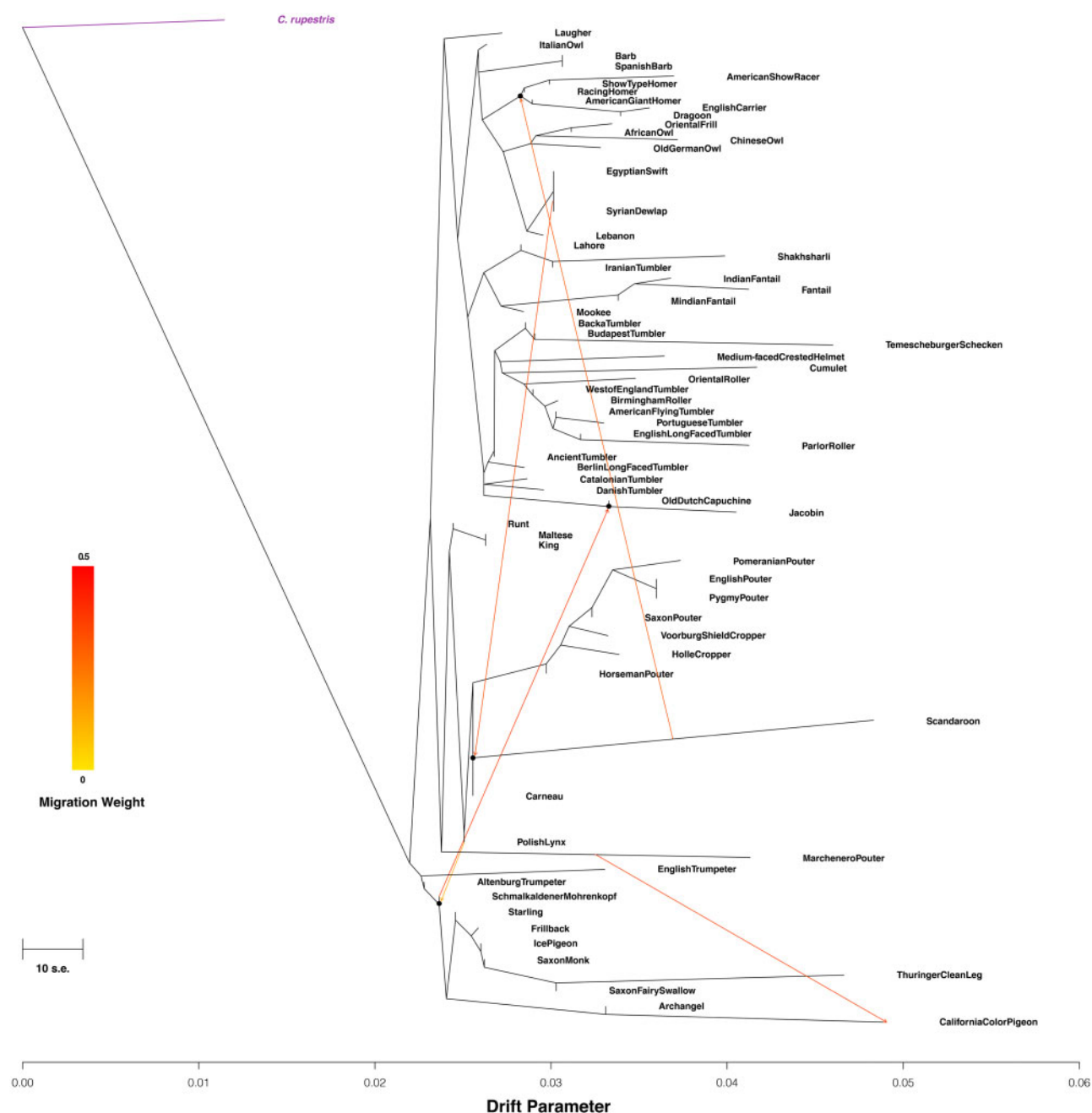
FIG. 5. —TreeMix ML phylogeny of pigeon breeds. Five migration events among different pigeon breeds are represented by arrows on the phylogenetic graph. The scale bar indicates ten times the average S.E. The outgroup is marked in purple. The model residuals are plotted in supplementary figure 9 , Supplementary Material online.

genomic data. Thus, as more genomic data sets are generated, we expect to learn much more about the history of many other pigeon breeds.