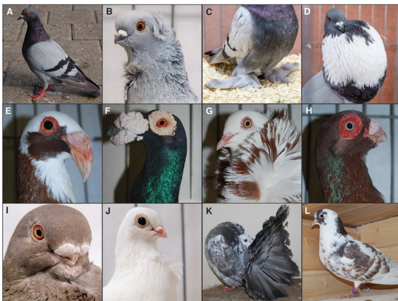
Fig. 1. —Examples of phenotypic diversity among pigeon breeds. (A) Feral pigeon presenting the blue-bar ancestor morph. (B) Hamburg Stick pigeon presenting the Crest, Frill, and ReducedBeak traits. (C) West of England Tumbler pigeon presenting the FootFeathering trait. (D) Pomeranian Pouter pigeon presenting the InflatedCrop trait. (E) Scandaroon pigeon presenting the EnlargedBeak trait. (F) English Carrier pigeon presenting the ProminentWattles trait. (G) Old Dutch Capuchine pigeon presenting the Crest trait. (H) Barb pigeon presenting the ProminentWattles trait. (I) African Owl pigeon presenting the ReducedBeak trait. (J) Figurita pigeon presenting the ReducedBeak and the Frill traits. (K) Fantail pigeon presenting the ExtraTailFeathers trait. (L) Laugher pigeon representing a breed that presents the SpecialVoice trait.

PRJNA427400, respectively). Each SRA file was converted into FASTQ format (using fastq-dump from SRA Toolkit v2.7; https://github.com/ncbi/sra-tools ), using default parameters plus options –split-files and –skip-technical .